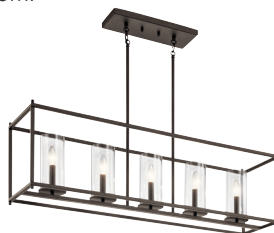
Linear Chandelier 43995OZ